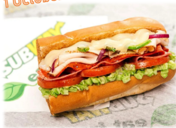
Subway days start 10 October'23 until Monday 29 January'24