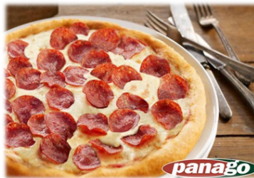
Pizza days start 14 October'23 until Thursday 25 January'24